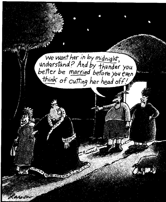
Henry VIII on the dating scene