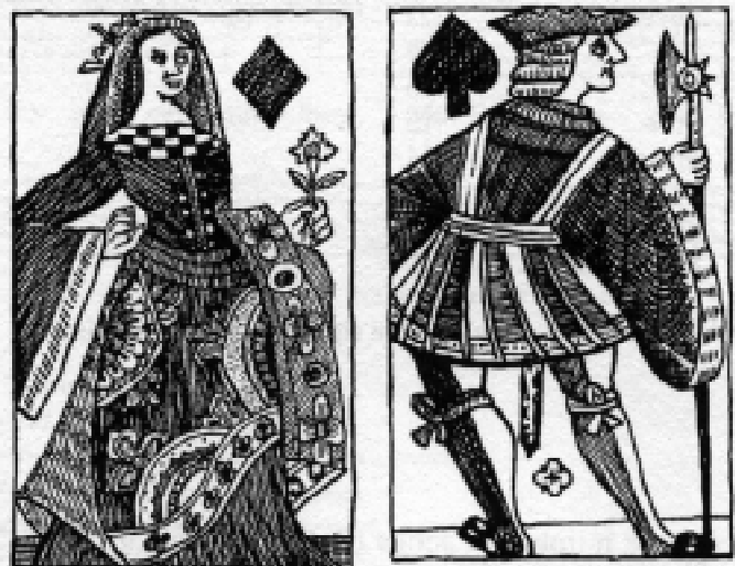
French playing cards of the late sixteenth century. [Hoomstra]